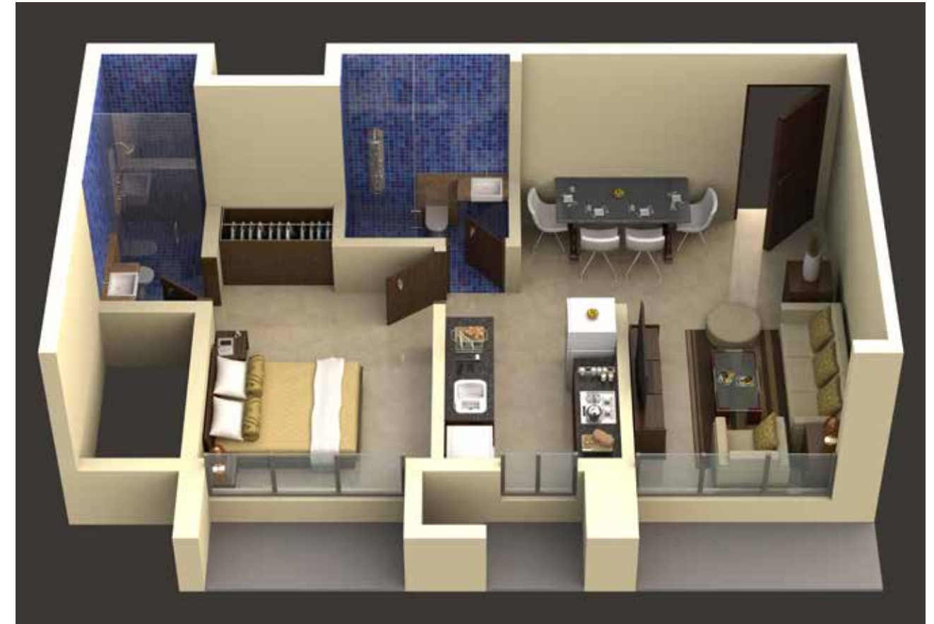
Interior & Furniture as proposed by space design at the cost of allottees