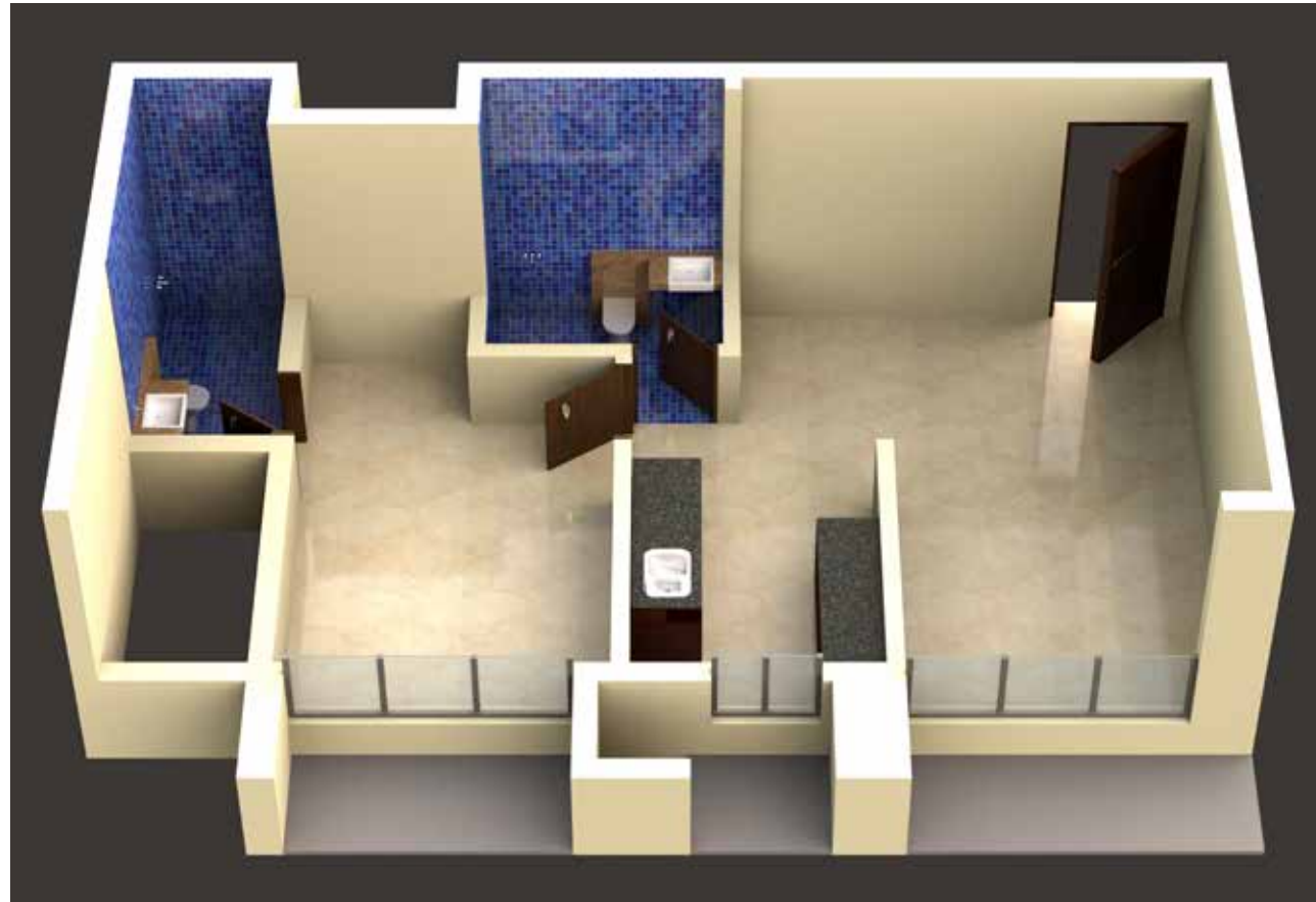
As per approved plans.