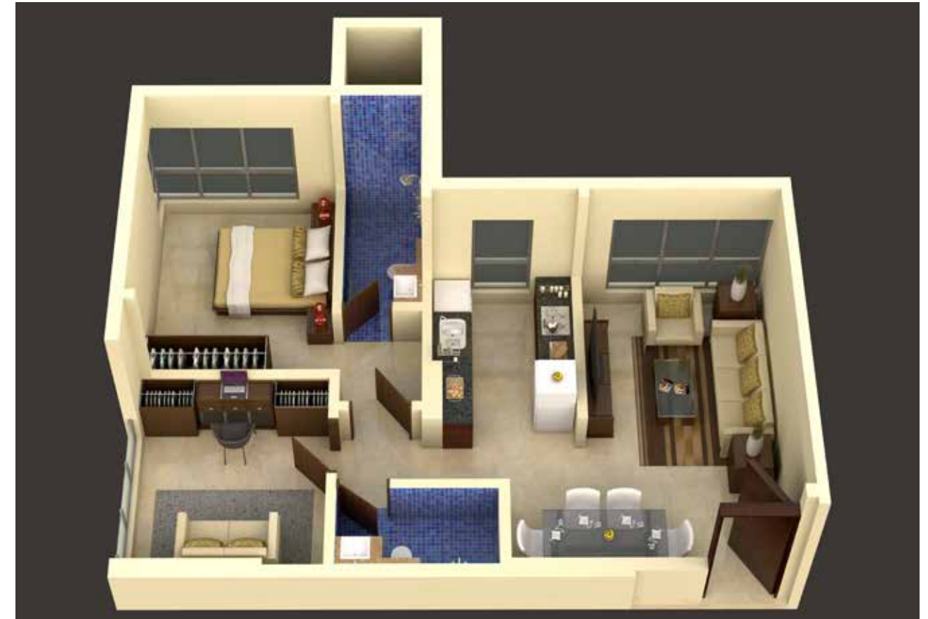
Interior & Furniture as proposed by space design at the cost of allottees