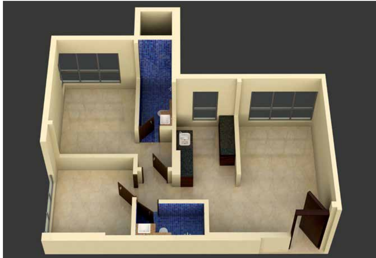
As per approved plans.